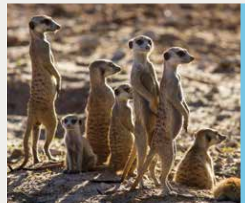
CENTRAL KALAHARI GAME RESERVE

The magnificent expanse of the Central Kalahari Game Reserve is a not-to-be-missed attraction when embarking on a Botswana safari. This is the largest, most remotely situated reserve in Southern Africa, offering almost exclusive wildlife sightings. After the wet season, the reserve becomes a hive of activity for large herds of plains game such as springbok and gemsbok. Visitors will also be treated to wonderful sightings of wildebeest, hartebeest, eland, giraffe, cheetah and the legendary black-maned lion. During the dryer months, the Central Kalahari reveals wide, desolate pans, which offer exceptional photographic opportunities. The reserve is well-known for providing awe-inspiring star gazing experiences as well as for its most notable attractions such as Deception Valley, the Sunday and Leopard Pans, Passage Valley and Piper's Pan.