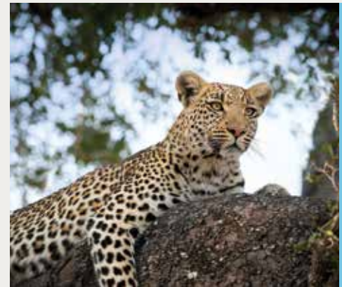
MOREMI GAME RESERVE

The only proclaimed wildlife reserve in the Okavango Delta, Moremi Game Reserve (and its spectacular Khwai area) is also widely regarded as the most beautiful. Moremi Game Reserve has the most diverse habitat and animal populations in Botswana. The reserve contains about a quarter of the Okavango Delta and stretches across several thousand square kilometres, comprising a stunning landscape of forests, lagoons, floodplains and islands. Game viewing is excellent year-round and resident species include lion, cheetah, leopard, elephant, African wild dog, zebra, red lechwe and many more.