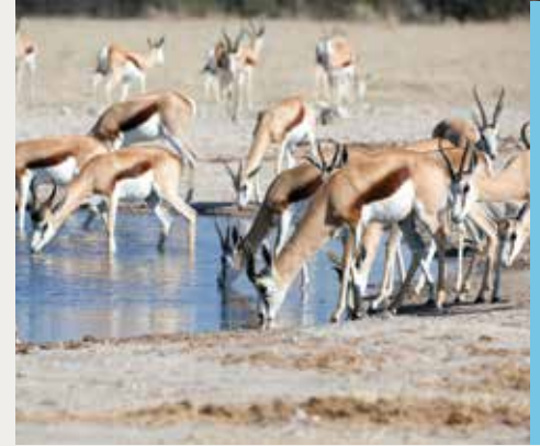
NXAI PAN NATIONAL PARK

Nxai Pan National Park is set on the northern fringe of the Makgadikgadi basin and includes Nxai Pan, an ancient lake bed that was once part of the vast Lake Makgadikgadi. At roughly 2 580 square kilometres this incredible destination offers stark contrasts between its dry and wet seasons. In the rainy season, it is home to the seasonal Zebra Migration, where vast herds (accompanied by a slew of predators) can be seen on open grasslands, amidst the mottled shade of acacia trees. During the dry season, visitors to the Nxai Pan National Park will be treated to sightings of wildebeest, springbok, impala, gemsbok, hartebeest, giraffe, lion, cheetah, wild dog, brown hyena, bat-eared fox, and occasionally elephant and buffalo.