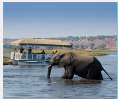
CHOBE NATIONAL PARK

Botswana’s famous Chobe National Park is a must-see wildlife destination that includes the Savute Channel and natural beauty of the Linyanti River. Chobe covers almost 11 000 km 2 (6 836 square miles), was the country’s first national park and boasts the biggest concentration of wildlife in Africa. Famous for its large concentration of elephant and buffalo, which congregate along the Chobe River, Chobe National Park offers adventures such as game drives, private river cruises, excellent birdwatching and exceptional photographic opportunities.