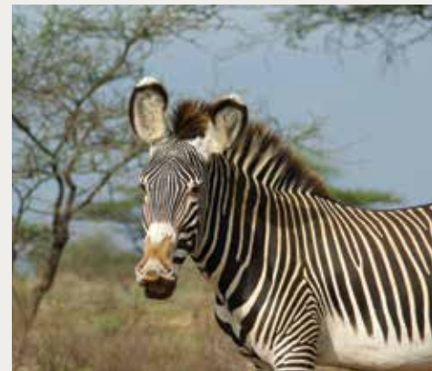
SAMBURU NATIONAL PARK

With its palm groves and dense forests the Samburu National Park offers pristine wilderness and breathtaking surrounds, boasting exceptional game viewing in remote splendour. The best feature of Samburu is not the wildlife or the picturesque surroundings, but the fact that it is one of the lesser-visited regions in Kenya. The peaceful atmosphere and the authentic wilderness experience set it apart from the better-known wildlife reserves in the country. Situated on the banks of the Ewaso Ng'iro River, there is plentiful wildlife and the bird watching is especially good. The rest of the reserve is fairly hot and semi-arid, making for easy game viewing.