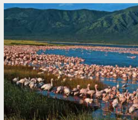
RIFT VALLEY AND SURROUNDS

The Great Rift Valley is another prized Kenyan attraction, boasting beautiful lakes and escarpments, which provide havens for plentiful wildlife. The region is a birdwatcher's paradise as it attracts a number of species to its sparkling lakeshores – most notably huge flocks of flamingos that happily wade near hippos and other game species. Three exceptional bodies of water; Lake Naivasha (the highest of the Rift Valley lakes), Lake Nakuru (renowned for its pelican colony) and Lake Elementaita, are the most well-known. Travellers visiting the region will be treated to exceptional sightings of leopard, white rhino, Rothschild's giraffe and an assortment of plains game.