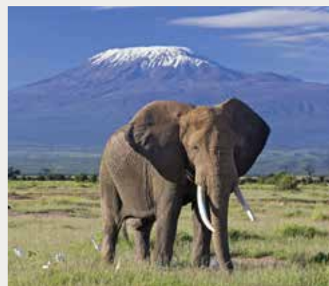
AMBOSELI, CHYULU AND TSAVO NATIONAL PARKS

A scenic park in its own right, Amboseli is synonymous with two particular things - majestic herds of elephant and glorious views of Kilimanjaro. Kenya's second most popular wildlife area, after the Maasai Mara National Reserve, Amboseli was declared a UNESCO-Mab Biosphere Reserve in 1991. The rugged wilderness of the Tsavo West National Park is famous for its incredible Mzima Springs and Shetani lava flows. Tucked in between these two fantastic destinations is the Chyulu Hills National Park, which boasts striking and diverse landscapes as well as some of the best views of Kilimanjaro.