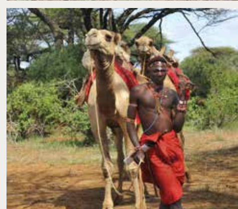
LAIKIPIA AND SURROUNDS

Lying on the edge of the Northern Frontier, the Laikipia Plateau stretches from the slopes of snow-capped Mount Kenya to the rim of the Great Rift Valley. Laikipia boasts one of the largest elephant populations in East Africa and is one of the last strongholds of the endangered black rhino. Despite its scattered mosaic of farms and cattle ranches, it is essentially still a wildlife refuge supporting huge numbers of game. Vast open plains in the shadow of a snow-capped silhouette create a tranquil and secluded setting, where game drives encounter abundant wildlife with not another vehicle in sight.