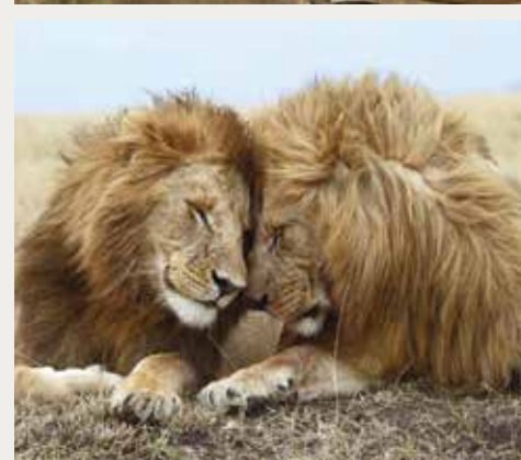
MERU NATIONAL PARK

Made famous by conservationist Joy Adamson and the film based on her book "Born Free", Meru National Park is arid with Doum palms and baobab trees dotting its landscape, but its 13 rivers and bubbling springs allow for thriving riverine habitats. It is a paradise for birdwatchers, as several rare bird species are found here. A small but highly diverse park, Meru has the feeling of a far larger wilderness – especially since the chances of seeing another game drive vehicle during your safari is incredibly remote, as the reserve is home to only one fully operational lodge. Meru National Park incorporates a 44 square kilometre (17 square mile) rhino sanctuary, which is home to both white and black rhino.