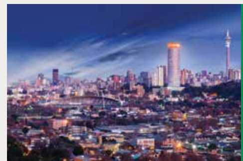
JOHANNESBURG AND PRETORIA

Known as the greatest gold-mining area on earth, the bustling city of Johannesburg is not just an industrial giant; it is the heart of the country's economy. From vibrant rural townships to exclusive boutiques in upmarket malls, theatres, museums, cultural villages, restaurants and more, Johannesburg is a diverse cultural melting pot, deserving of its name of 'iGoli' – or 'City of Gold'. South Africa's administrative capital of Pretoria was proclaimed in 1853. It is home to four universities and a host of museums, as well as beautiful buildings, such as the impressive Union Buildings, designed by Sir Herbert Baker.