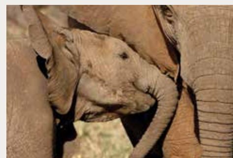
EASTERN CAPE GAME RESERVES

A province of dramatic contrasts, South Africa's Eastern Cape is home to some of the country's most varied landscapes. From the arid stretches of the Karoo to the lush rolling hills of the Transkei, the Eastern Cape is a tourist mecca. Here, a number of Big Five game reserves boast an exceptional range of game viewing adventures that will delight any wildlife enthusiast. The Addo Elephant National Park provides some of the world's most spectacular elephant viewing and the unique opportunity to view marine life such as whales and great white sharks. Equally sensational is the Shamwari Game Reserve (home to the Born Free Big Cat Rescue and Education Centres) and Kwandwe Private Game Reserve's 22 000 hectares (54 000 acres) of pristine wilderness.