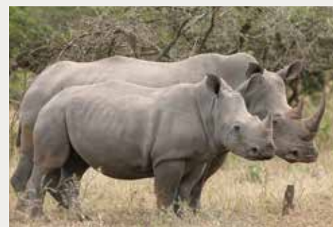
MADIKWE GAME RESERVE AND WATERBERG

Discover a range of safari experiences at Madikwe Game Reserve, in South Africa's North West Province. This 76 000 hectare (187 800 acre) reserve boasts the Super Seven – adding cheetah and African wild dog to the famous Big Five. The Madikwe region is rich in history, having seen the passage of the famed warrior Mzilikazi, as well as Dr David Livingstone and Sir Cornwallis Harris. Nearby, in South Africa's Limpopo Province, you will find the Waterberg region. Meaning "Water Mountain" in Afrikaans, this region boasts a spectacular tapestry of untamed wilderness, interspersed by valleys and undulating hills that flank the blue-tinted expanse of the Waterberg Mountain Range.