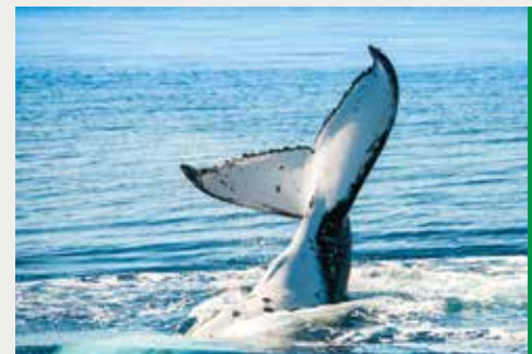
WHALE COAST AND GARDEN ROUTE

The pristine Cape Whale Coast is flanked by majestic mountains and the Atlantic Ocean. The entire route is renowned for its generous whale sightings, particularly in the Walker Bay area between Hermanus and Gansbaai. Whales swim into the bay to mate and give birth, and give onlookers a show with their breaching theatrics. Equally spectacular, the Garden Route is one of the most visited areas in South Africa. Running along the Western Cape coast, the Garden Route boasts pristine white beaches, lakes and forests, rivers and wild flowers in their millions - the scenery is diverse and breathtakingly beautiful.