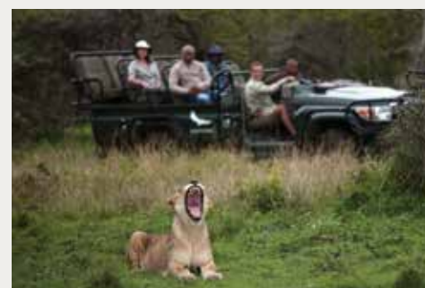
&BEYOND PHINDA PRIVATE GAME RESERVE

Set within easy reach of the Indian Ocean coastline and the famous iSimangaliso / Greater St Lucia Wetland Park, &Beyond Phinda Private Game Reserve is known for its abundant wildlife, diversity of habitats and wide range of safari activities. Referred to as the 'Seven Worlds of Wonder', the reserve's fascinating variety of landscapes shelter the Big Five and many rarer and less easily spotted species, such as the elusive cheetah or the scarce black rhino. Adding to Phinda's wildlife charms, the marine diversity of nearby Sodwana Bay is easily accessible, with exceptional scuba diving, fishing and even turtle watching listed as some of its main attractions.