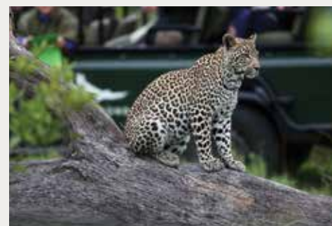
SABI SAND GAME RESERVE

The Sabi Sand Game Reserve is situated in the southwestern corner of the world-renowned Kruger National Park and consists of 65 000 hectares (160 620 acres). It is the most prestigious game reserve in South Africa, and is famous for incredible leopard sightings. With no fences between the farms (or, for that matter, between them and the Kruger Park), animals wander across vast stretches of grazing land as they did years and years ago. With one of the richest game populations in the country, the chances of seeing the Big Five (lion, leopard, buffalo, elephant and rhino) are excellent.