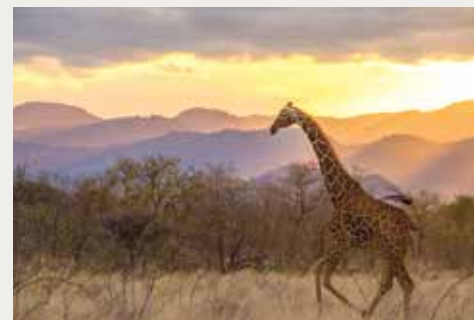
KRUGER AND SURROUNDS

The world-famous Kruger National Park is South Africa's largest game reserve and one of the finest wildlife sanctuaries on the planet. The Kruger National Park has nearly two million hectares of unfenced African wilderness, in which more mammal species roam free than in any other game reserve. Within the Kruger National Park lies &Beyond Ngala Private Game Reserve, the first private game reserve to be incorporated into this famous park; and bordering the Kruger are other renowned private reserves such as the Sabi Sand and the Timbavati Game Reserve. The Kruger National Park is easily accessible via Johannesburg (only a four-hour drive away) and is near to scenic towns such as Graskop, White River and Pilgrims Rest.