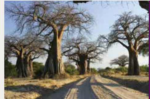
RUAHA NATIONAL PARK

At 20 226 square kilometres (7 457 square miles), the pristine and untouched Ruaha National Park is the largest National Park in Tanzania. Ruaha is bordered in the north by the Kizigio and Rungwa River Game Reserves, and together they form a 26 500 square kilometres (10 230 square mile) conservancy, one of the biggest in East Africa. The focal point of the reserve is the Great Ruaha River, with its deep gorges and swirling rapids. The river is an excellent fishing destination. With over 10 000 elephant, 30 000 buffalo, 20 000 zebra and huge populations of lion and leopard (not to mention more than 500 bird species), Ruaha is a wildlife enthusiast's paradise.