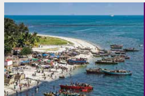
DAR ES SALAAM AND COAST

Despite its name, which means "abode of peace" in Arabic, Dar es Salaam is Tanzania's largest and busiest city. It is the country's most important business and commercial hub and is situated right on the Indian Ocean. It is the main port of call for most visitors, as it is an ideal location from which to access both the wilderness areas and the beaches of Tanzania and Zanzibar*. Most visitors en route to the better-known Tanzanian attractions are surprised by the charm of this unassuming city. Must-see attractions include the beautiful beaches of Kunduchi, Mjimwena and Mbwa Maji, Dar es Salaam's spectacular harbour and the local markets.