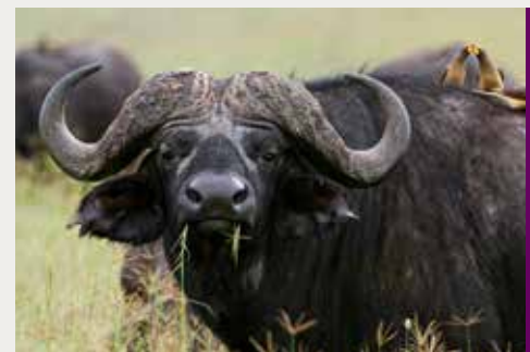
MAHALE AND KATAVI NATIONAL PARKS

Home to the largest herds of buffalo on the planet, the Katavi National Park is a relatively untouched wilderness paradise, situated in the western area of Tanzania. The park is home to a plethora of antelope, elephant; and over 400 different bird species. Visitors can seek out the legendary tamarind tree, which is said to house the spirit of a great huntsman named Katabi. Nearby, set among the forested slopes of the Mahale Mountains, the Mahale Mountains National Park is renowned for being one of the best places in the world for chimp safaris. Some 50 species of animals have been recorded in the park, predominant among these being representatives from various monkey and ape families.