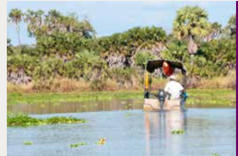
SELOUS GAME RESERVE

Secluded and off-the-beaten-track, the Selous Game Reserve offers visitors a slice of undisturbed wilderness, teeming with a spectacular array of fauna and flora. It was declared a World Heritage Site due to its dramatic landscapes and great diversity of wildlife. The Selous is one of the few big game reserves to allow hiking, offering nature lovers the chance to explore Tanzania's pristine landscapes on foot. Covering an area the size of Switzerland, it is amongst the largest protected areas in Africa and is relatively undisturbed by human impact.