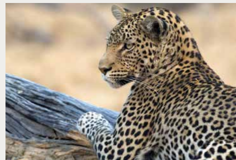
SOUTH LUANGWA NATIONAL PARK

Renowned as one of Africa's greatest wildlife sanctuaries, South Luangwa is home to an abundance of game, which frequents the Luangwa River and its oxbow lagoons. The Luangwa River is the most intact river system in Africa and is the life blood of the park's 9 050 square kilometres (3 500 square miles). South Luangwa is also the birthplace of the walking safari – one of the best ways to get up-close-and-personal with the park's pristine wilderness, which boasts 60 animal species and over 400 bird species. While out on the plains, visitors can view large herds of elephant, some up to 70 strong, and encounter the mighty buffalo.