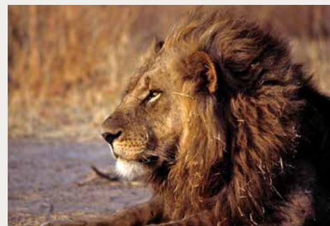
KAFUE NATIONAL PARK

Established in 1950, Kafue is Zambia's oldest national park. It is the second largest wildlife sanctuary in the world, spanning 22 400 square kilometres (8 650 square miles) of spectacular African wilderness. Spread over such a vast area, the Kafue National Park offers visitors excellent game viewing, birdwatching and fishing adventures. The beautiful Busanga Plains, in the north, stretch as far as the eye can see and are one of Zambia's most significant wetland resources. Fertile dambos situated in the south are fed by the Lunga, Lufupa and Kafue Rivers – prime locations for viewing some of the 400 species of birds found in the park.