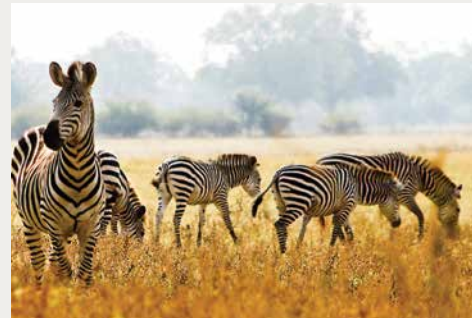
LIUWA PLAINS NATIONAL PARK

Regarded as a "game reserve" from as early as the 19th century, by the Lozi people who were charged with looking after its wildlife by their Litunga (king), Liuwa Plains National Park, was officially recognised by the government in 1972. Its remoteness, in Zambia's far west reaches, ensures a wonderfully pristine wildlife experience where vast herds of wildebeest, wild dog and lion inhabit the region's golden plains. The park is also home to a plethora of bird species making for ideal off-the-beaten-track birdwatching excursions. There is a local Lozi legend that tells of a Litunga, who planted his walking stick on the plains, and it grew into a large mutata tree. This tree can still be seen in the national park.