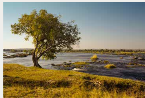
LOWER ZAMBEZI NATIONAL PARK

The spectacular Lower Zambezi National Park spans 4 092 square kilometres (1 580 square miles) of pristine wilderness. It is situated adjacent to Zimbabwe's Mana Pools Reserve, creating a giant expanse of protected wilderness, and boasts breathtaking vistas of the Zambezi River, as well as lush riverine surrounds. It is not uncommon to see enormous herds of elephant along the riverbanks, as well as leopard, buffalo and lion. The park offers a wonderful collection of habitats, which are home to a superb diversity of animals. Unlike the Luangwa, the Zambezi is navigable year-round, so most camps offer a full variety of water activities alongside their standard walking and driving options.