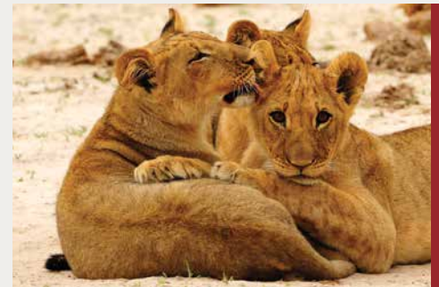
HWANGE NATIONAL PARK

Zimbabwe's largest national park, the elephant stronghold of Hwange is a game-rich area roughly the size of the Bahamas that was once the royal hunting grounds of the Ndebele warrior king Mzilikazi. It was proclaimed a national park in 1929. Here, guests can explore a variety of landscapes, from desert sands and sparse woodlands to grasslands and rocky outcrops. Vast herds of elephant and buffalo, gemsbok and packs of brown hyena can be found in this pristine slice of wilderness, which also boasts one of the largest surviving populations of African wild dog.