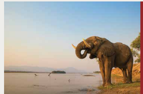
MANA POOLS NATIONAL PARK

A UNESCO World Heritage Site, Mana Pools offers a truly remote and rugged wilderness experience. Here, visitors to the park can encounter a plethora of wildlife that ranges from large mammals to over 350 bird species. Meaning "four" in the local Shona language, Mana refers to the park's four large pools that are vestiges of ancient ox-bow lakes carved out by the mighty Zambezi. Situated in the middle of the Zambezi Valley, the Mana Pools National Park offers the incredible opportunity to embark on expertly guided canoe trails.